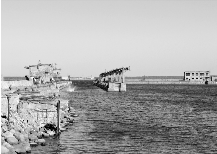
Fig. 6. The former Soviet Submarine Demagnetising Base in Hara is mostly seen as unique and a site worth preserving.

The interviewees without personal memory of the Soviet period had heard of the border zone and closed military towns either from their parents, books, TV or history teachers, but the information was very general, a little confused and they mostly could not connect it to certain areas or name any restrictions. The overall attitude in that age group was indifferent as they had no personal experiences.