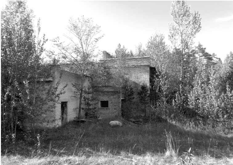
Fig. 2. Most of the Soviet military installations are abandoned and taken over by the nature (Soviet military remnants in Suurpea).

private property. There was also the problem of pollution: Raukas [9] has reported that the Soviet military had polluted extensive areas of soil with oil fuel products (4335 ha), scrap metal (850 ha) and chemicals (85 ha). Any economic benefits of displaying such landmarks as tourist attractions were diminished by their sheer extent and uniformity, as well as by their potential to evoke painful memories in the newly independent nation [10]. As there were no resources and no State interest, most of the structures were ignored and forgotten for decades. They were left open to the elements and slowly began to deteriorate leaving the sites to become derelict wastelands (fig. 2). Altogether, the existence of the border-zone caused a paradoxical combination of vast areas of land contaminated by toxic waste and derelict buildings but also vast natural areas rich in biodiversity to develop and to be preserved [2] (fig. 3).