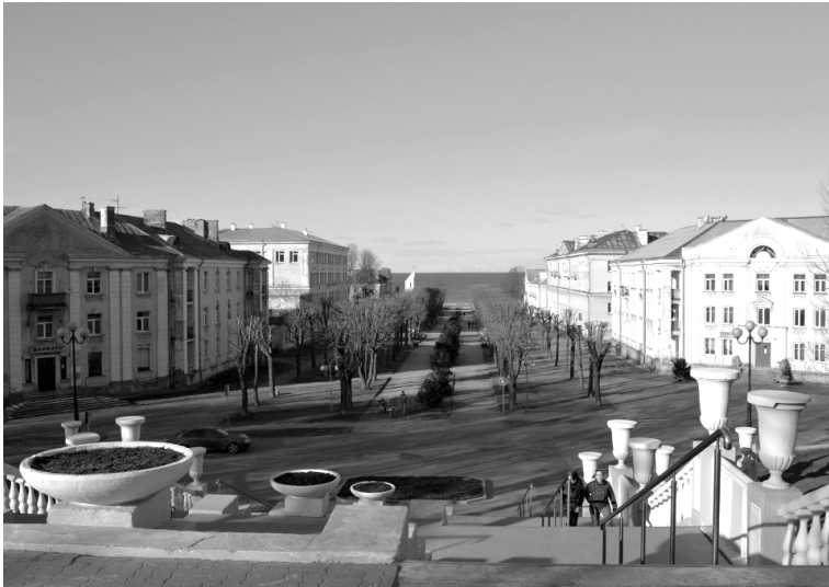
Fig. 5. The former closed military town of Sillamäe.

and were alert at all times. It was said that the town itself was beautiful, but they visited it mostly for mercantile interest and not for fun or vacation.