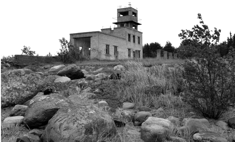
Fig. 3. The former border guard building in Pärisepa is located in the Estonian Green Belt area in Lahemaa National park.