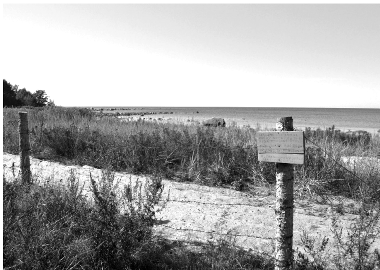
Fig. 4. The reminder of the raked and fenced beach security zone in Juminda.

The former resort village of Sillamäe (fig. 5) was turned into a closed military town in 1940s, when the old oil shale processing plant was rebuilt for uranium production using the labour of convicts and war prisoners [14]. The town was closed for outsiders without special permits and inhabited by military personnel and scientists who were nearly all Russian speakers brought from other parts of the Soviet Union. Nevertheless, the town was famous as a trade centre. Most of the respondents from Ida-Virumaa said that they had visited the town secretly at some point to buy things you could not find in regular shops elsewhere. Although the town was heavily militarized, it was not that hard to get in, if you knew where and when to enter. However, it was a lot harder to move around unnoticed, as you could be exposed in any shop because of an Estonian accent or asked to show your passport to check the permit, which is why all the respondents said that they felt the military presence there